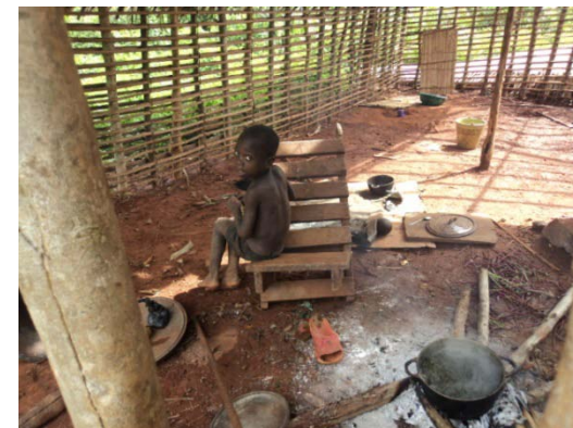
Waiting for his mother to serve him lunch Bonne appetite!

Although we are on holidays, we feed the children twice a week, those that are able to make it to school since some help their parents in farms, hunting, fishing, cooking etc.