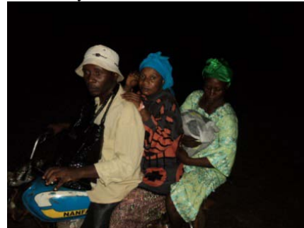
Taking his wife, baby and mother home