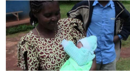
Baby 29 with Grandmother