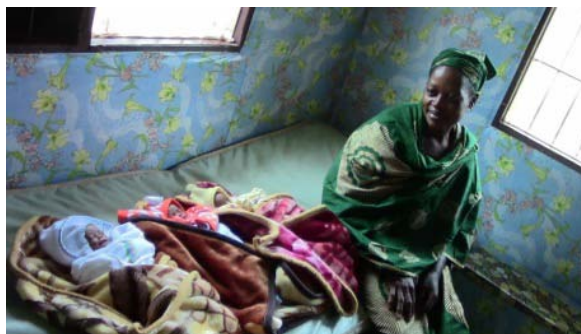
Mother with triplets