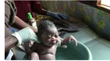
Giving baby 28 a bath