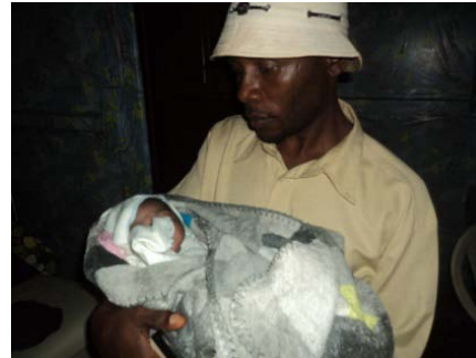
Father with Baby 26