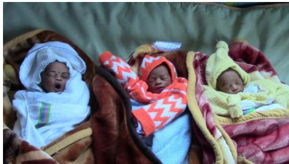
Our first set of triplets

May the LORD GOD Bless and Keep You All in JESUS Name.