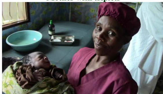
Our Traditional Birth Attendant with Baby 30