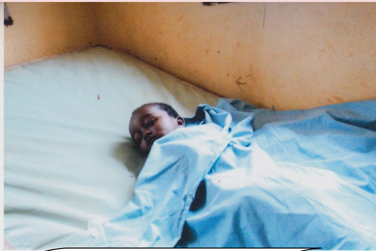
Baby receiving malaria treatment at the clinic

During the transition period from the rainy season to the dry season, many folks are affected by the weather. It is not uncommon to find many cases of malaria, and other malaise. However, we are grateful to God for the clinic and the medical staff. Thank you so much for all you are doing to keep us healthy. We really appreciate everything.