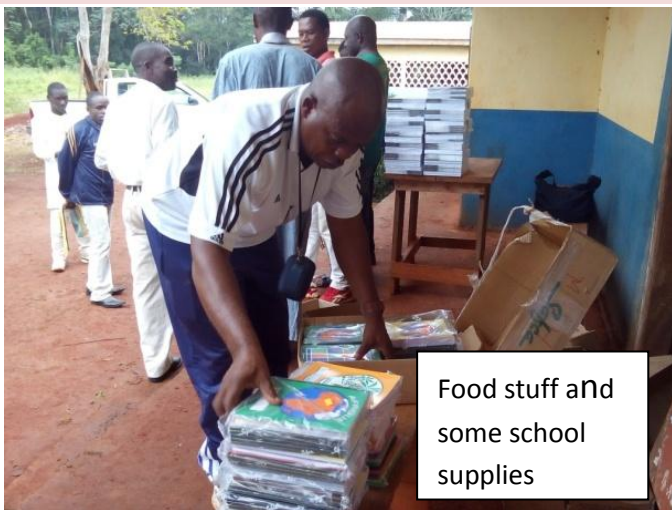
Food stuff and some school supplies