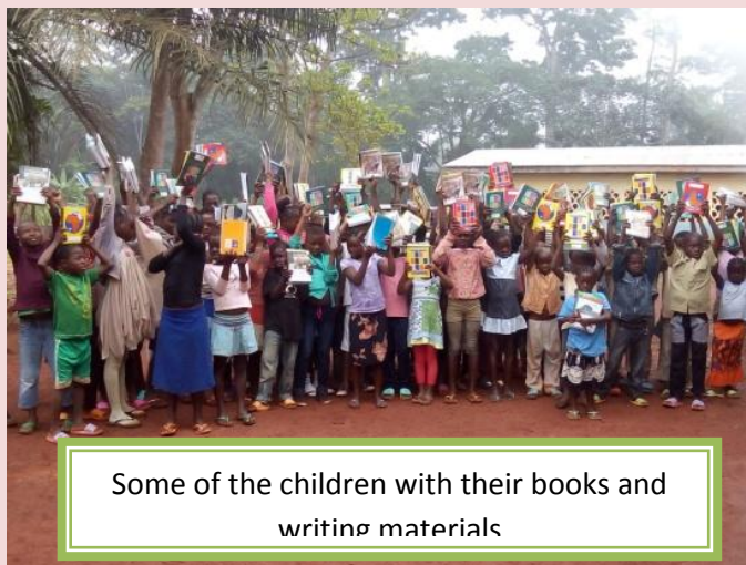
Some of the children with their books and writing materials