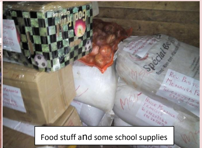
Food stuff and some school supplies