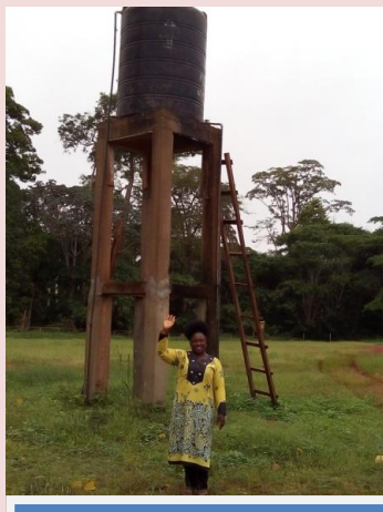
Cleaning of the water tank and treatment of the water