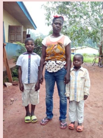
One of the parents coming to register her sons