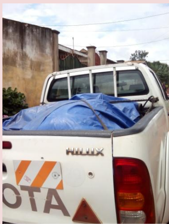
Our truck loaded and ready to go. Our truck remains a